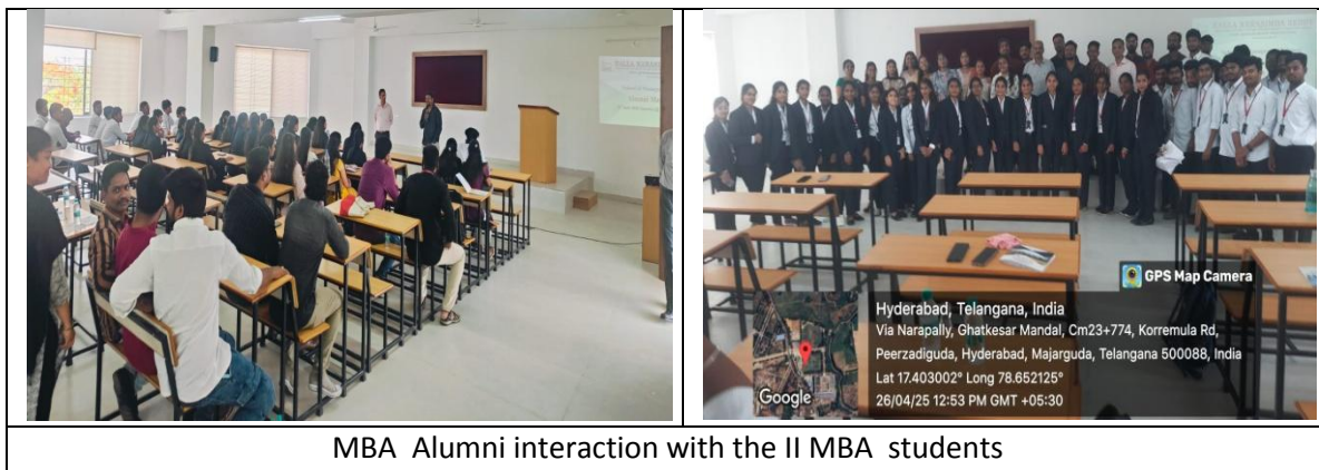
MBA Alumni interaction with the II MBA students

A few alumni highlighted along with the following suggestions to the NNRG students regarding: