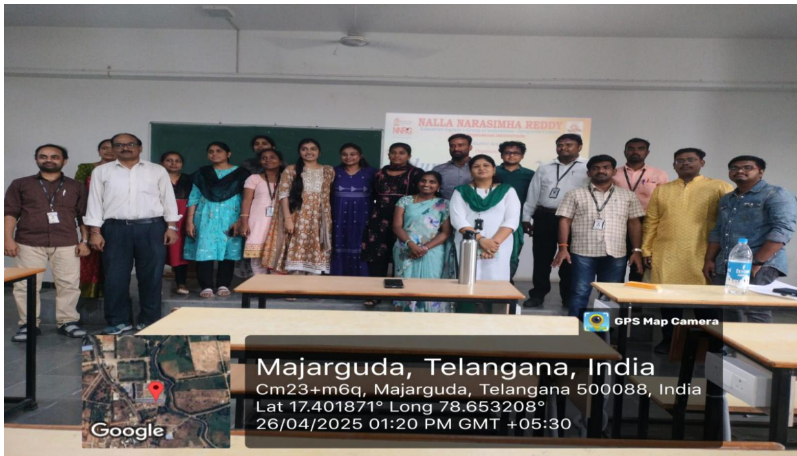
ECE alumni with Department Faculty