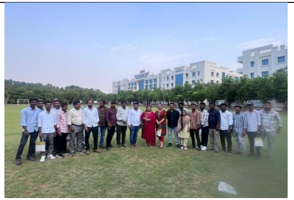
Civil Alumni with Faculty