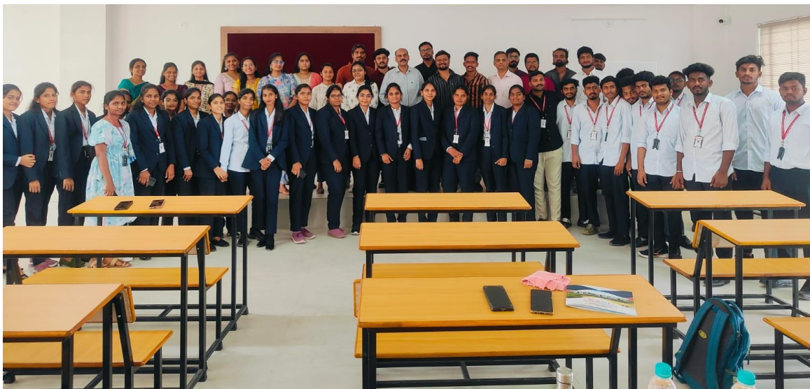
ALUMNI GROUP PHOTO with MBA Department Faculty