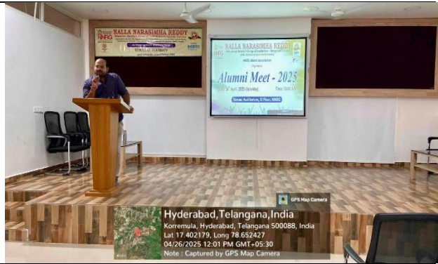
Pharmacy Alumni addressing with Pharmacy students