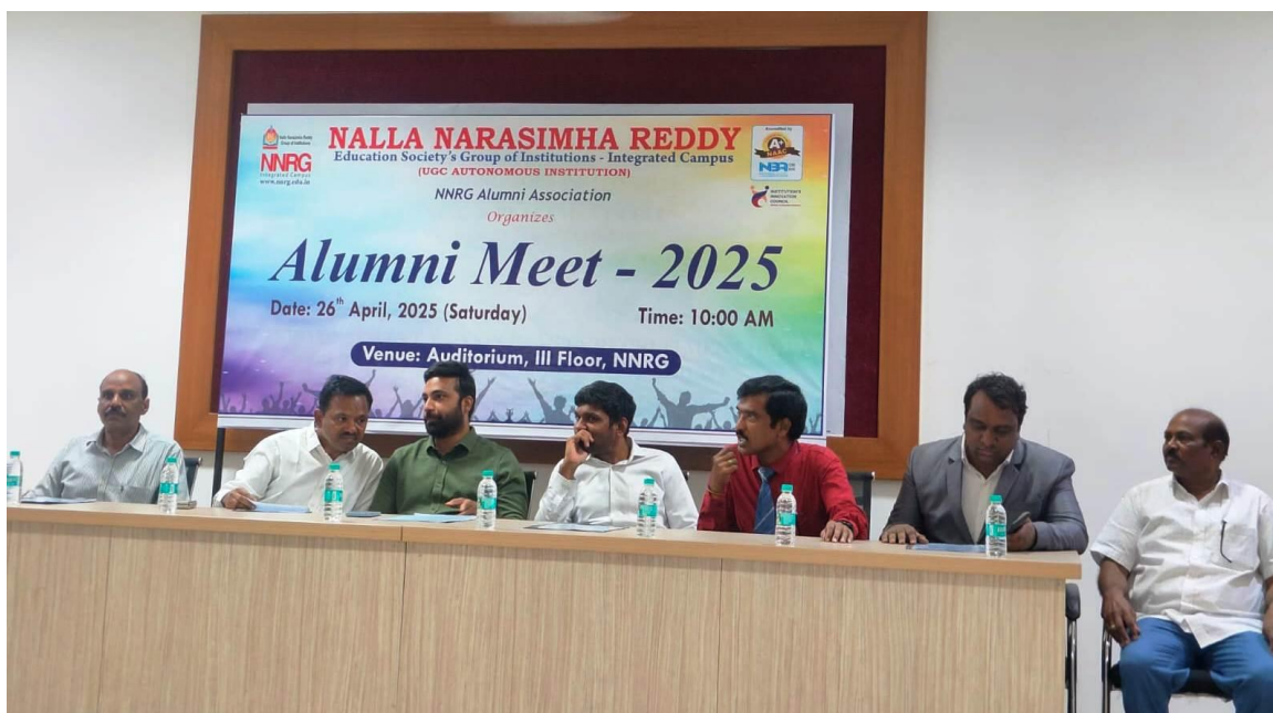
Alumni Meet 2025 administrators on the dias