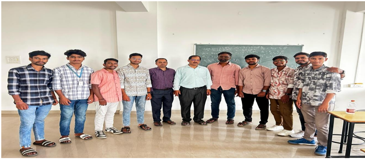
ALUMNI with Mechanical Dept Faculty