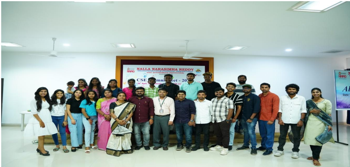
Alumni with CSE Department Faculty